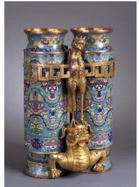
Cloisonné double vase, Chinese 18 th century. George Walter Vincent Smith Art Museum, Springfield, Mass.