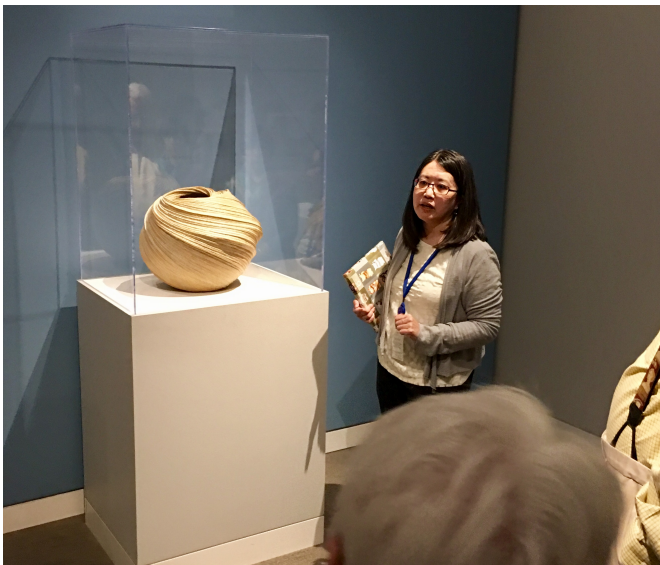
SAA members enjoying a tour by Crocker Museum curator Amelie Chau of the exhibition Into the Fold: Contemporary Japanese Ceramics from the Horvitz Collection .