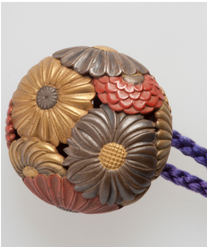
Manju (cake)-type openwork netsuke of chrysanthemums, approx. 1800–1900. Japan. Carved and lacquered wood. Asian Art Museum of San Francisco, The Avery Brundage Collection, B70Y1434 .

Visit to exhibition of Korean contemporary artists at Mills College