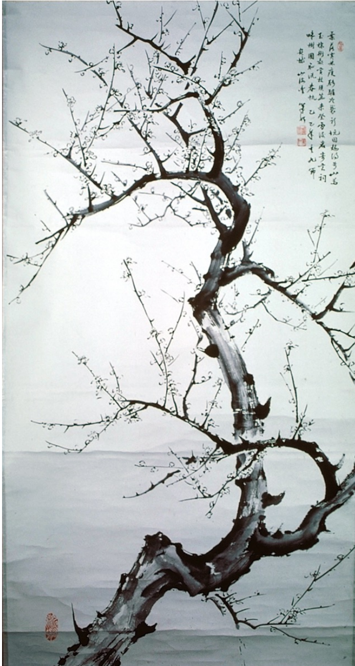
Plum Blossoms , 1965, by Xiao Ru (Chinese). Ink on paper. Asian Art Museum of San Francisco, The Avery Brundage Collection, B66D5.